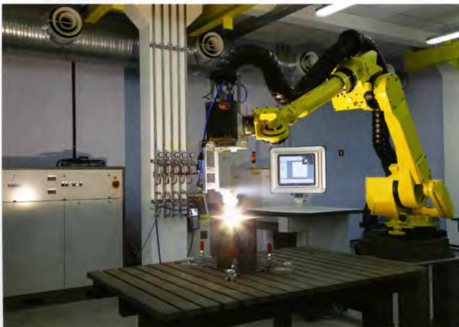
Fig.3 – Laser system Labyrinth

For complex-shaped welded structures, we have designed a robotized complex for laser cutting and welding in various positions (see Fig.2). The machine is unique due to use of 25 kW laser LS-25, one of the most powerful in Russia, and optical four-channel switch, allowing to use laser optical heads in turn for welding and cutting at the same machine, thus substantially reducing manufacturing time of welded structures. With simultaneous reducing of welding deformations in 1.4 times comparing to