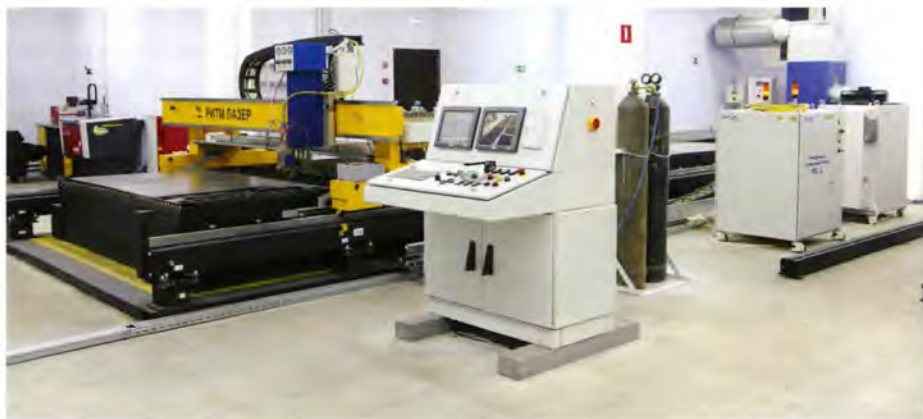
Fig. 1 – Portal complex for laser cutting RITM-LASER

Apart from laser cutting machines, JSC SSTC is developing a number of program-controlled complexes for laser cutting and welding, designed for shipbuilding and marine engineering sector.